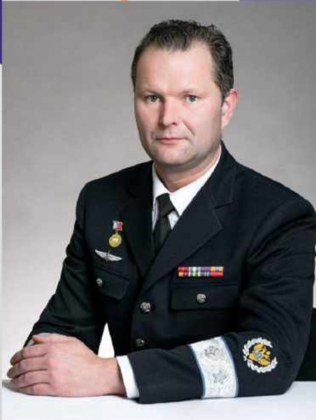
Dmitry Stanislavovich Zverev

State Secretary – Deputy Minister of Transport of the Russian Federation