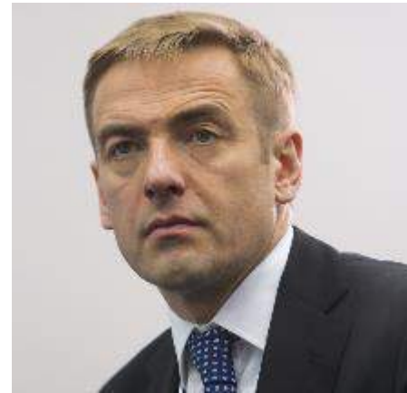
Mr. Viktor Evtukhov, Deputy Minister of Industry and Trade of the Russian Federation