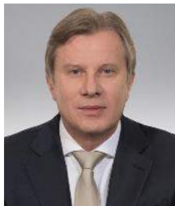
Mr. Vitaliy Saveliev, Minister of Transport of the Russian Federation