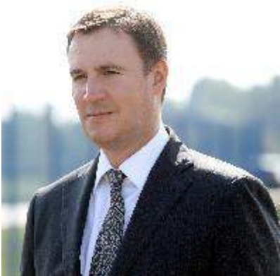
Mr. Dmitriy Patrushev, Minister of Agriculture of the Russian Federation