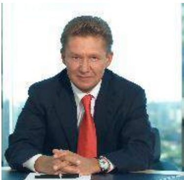
Mr. Alexey Miller, Chairman of the Board, GAZPROM