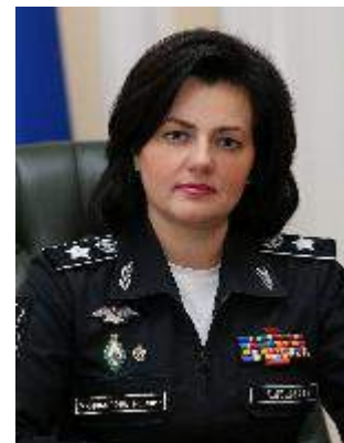
Mrs. Tatiana Shevtcova, Deputy Minister of Defense of the Russian Federation