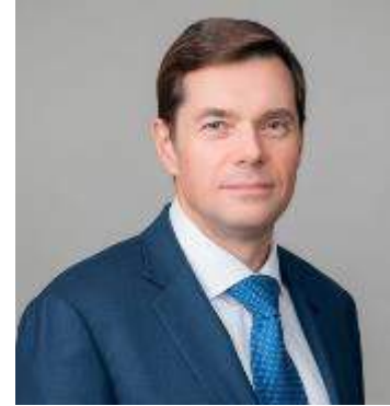
Mr. Aleksei Mordashov, Chairman of the Board, Severstal