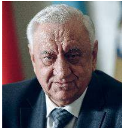
Mr. Mikhail Myasnikovich, Head of Eurasian Economical Commission