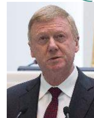
Mr. Anatoliy Chubais Presidential Envoy for the International organizations