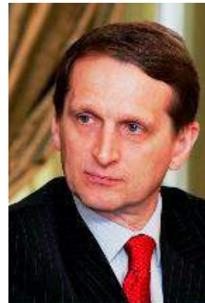
Mr. Sergey Naryshkin, Director, Intelligence Service of the Russian Federation