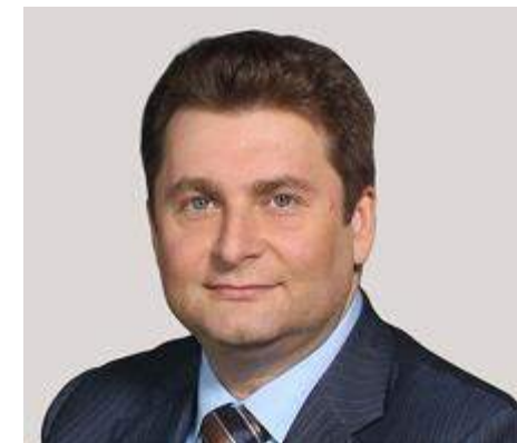
Mr. Aleksandr Morozov, Deputy Minister of Industry and Trade of the Russian Federation