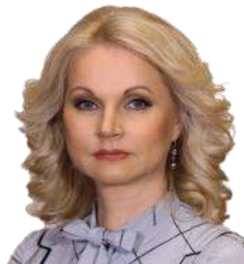
Mrs. Tatiana Golikova, Deputy Prime Minister of the Russian Federation